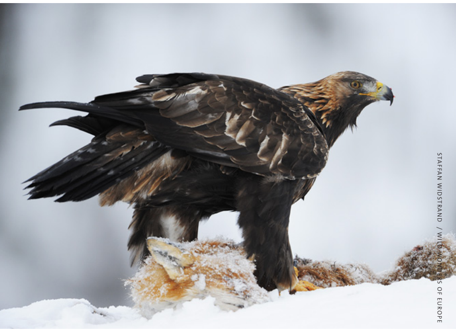
STAFFAN WIDSTRAND / WILD WONDERS OF EUROPE