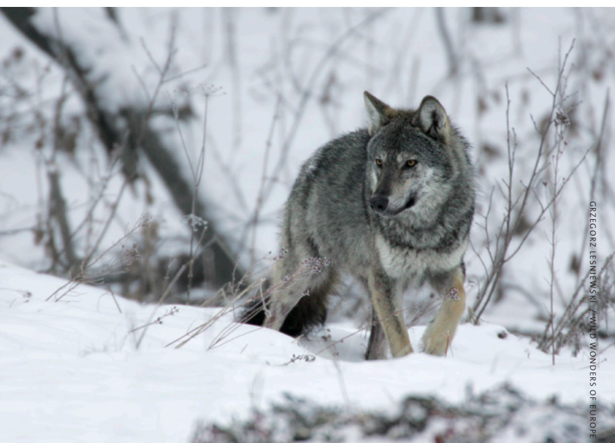
GRZEGORZ LESNIEWSKI / WILD WONDERS OF EUROPE