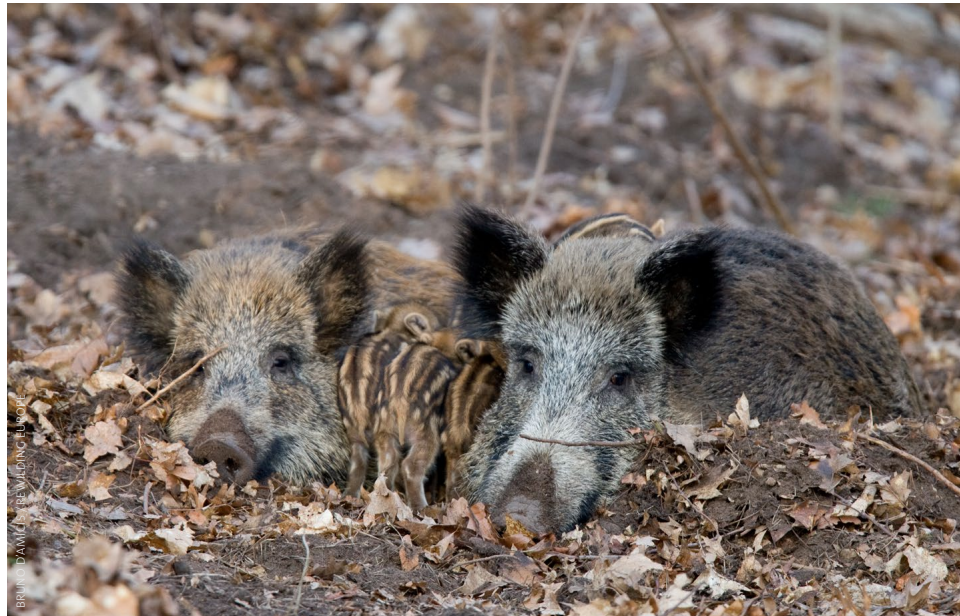
Because of its impact on the landscape, the wild boar is a true keystone species.

“This isn’t just about wildlife conservation,” says Raquel Filgueiras, Rewilding Europe’s Head of Rewilding. “Fully intact ecosystems perform many essential functions – purifying air and water, turning decaying matter into nutrients, preventing erosion and flooding, mitigating climate change and enhancing people’s wellbeing. Humans need keystone species to maintain the health and resilience of the ecosystems that support us.”