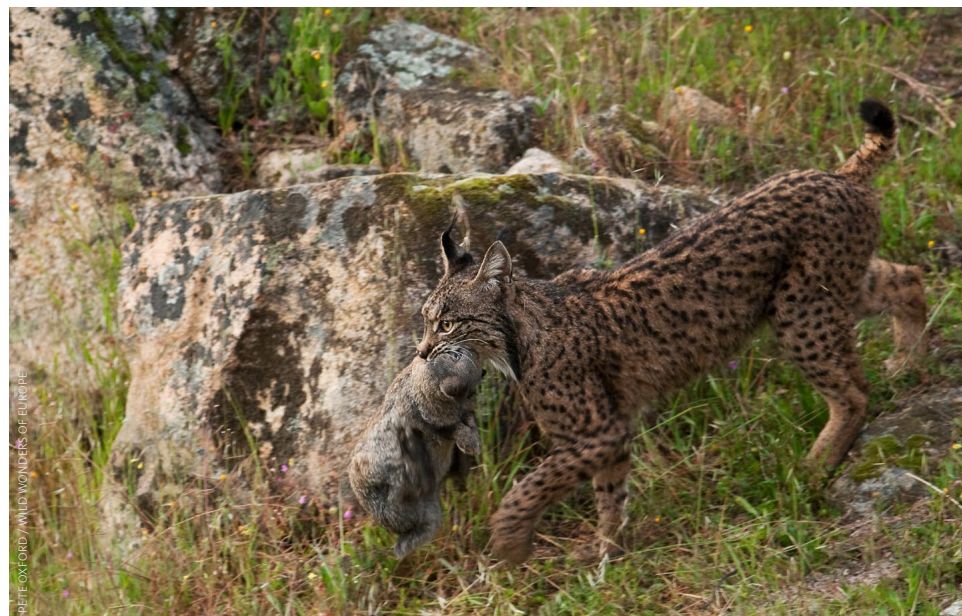
A female Iberian lynx in Sierra de Andújar Natural Park, Spain. Today the world's rarest cat species is making a comeback, but is still vulnerable.

“More research and assessment is needed in this area, especially in human-dominated landscapes,” he continues. “Determining the relationship between ecosystem restoration and keystone species requires a better understanding of the intricacies of nature.”