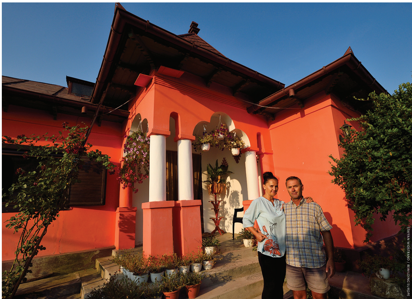
STEFAN WIDSTRAND / REWILDING EUROPE

JENICA PENSION is cozy owner run guesthouse and this is the base for your stay in Sf. Gheorghe, and Jeni & Dumitru will be your hosts. The pension has 3 en suite rooms, wifi in the main area and a great central location within this little waterside fishing village.