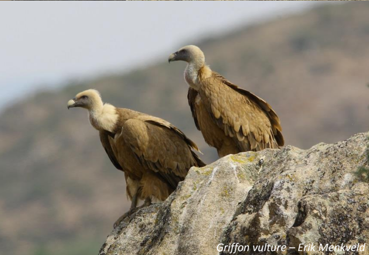
Griffon vulture