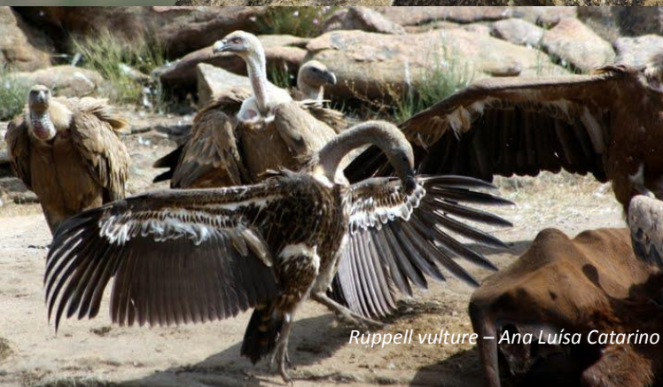
Ruppell vulture – Ana Luísa Catarino

“The scene is fascinating and the landscape around the vulture feeder is exciting, with the Côa valley in the back in its old and mythical silence. The soaring of the Griffon vultures at a few meters and the fast gliding fights of the Kites start increasing your adrenaline levels, which peak when the majestic Egyptian vulture lands 15 meters away from the hide, testing its peculiar way of walking. You only hear the cameras shooting; you look for the best angle and that particular background of the rocks. An unforgettable experience for any ornithologist or nature lover!” Dinis Cortes