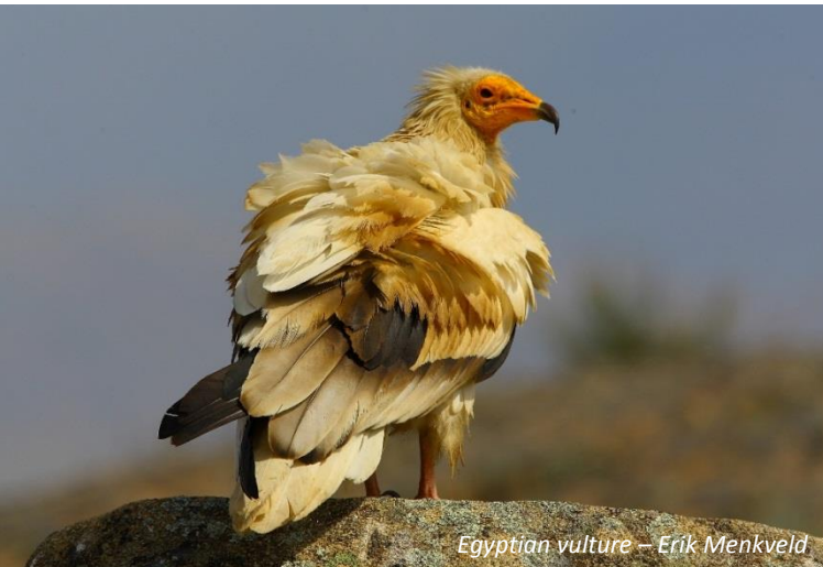
Egyptian vulture – Erik Menkveld

The vulture feeder at Faia Brava features a hide for observation and photography. While in the hide, you can view an incredible variety of bird species as they feed on the remains of animal bone and flesh. All visitors at Faia Brava are welcome to watch one of the most impressive scenes of wildlife in West Iberia.